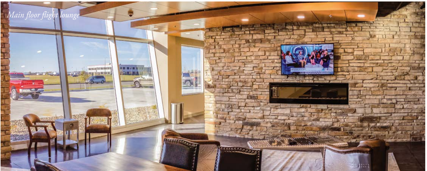
Main floor flight lounge