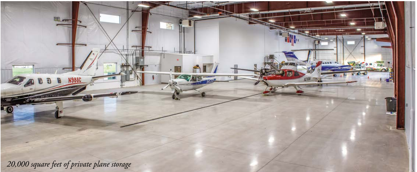
20,000 square feet of private plane storage