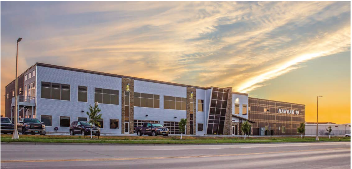
The exterior of Hangar 19 at Hector International Airport.